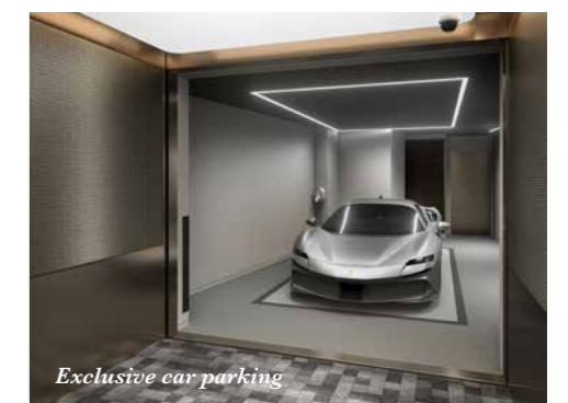
Exclusive car parking

The heart of VELE beats in its three-storey clubhouse, where every level feels like a chapter in an epic story of leisure and well-being. On the ground floor, a soaring double-height foyer spills into a relaxed lounge where friends gather over coffee or a pre-dinner cocktail. Cozy reading corners sit alongside a discreet barista station, and beyond them you’ll find an intimate deck shaded by sail-inspired canopies, perfect for gentle stretches at dawn or impromptu conversations under a canopy of stars.