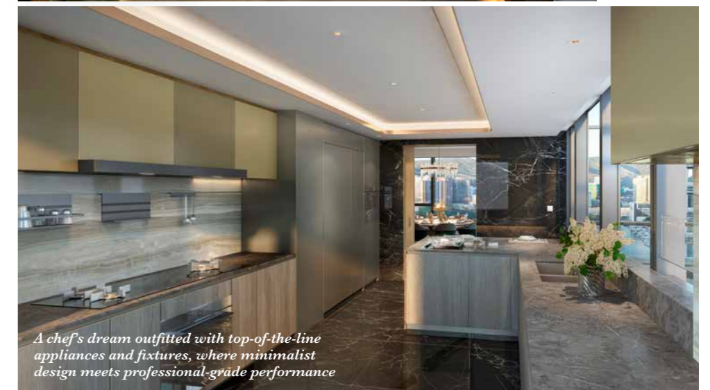
A chef's dream outfitted with top-of-the-line appliances and fixtures, where minimalist design meets professional-grade performance