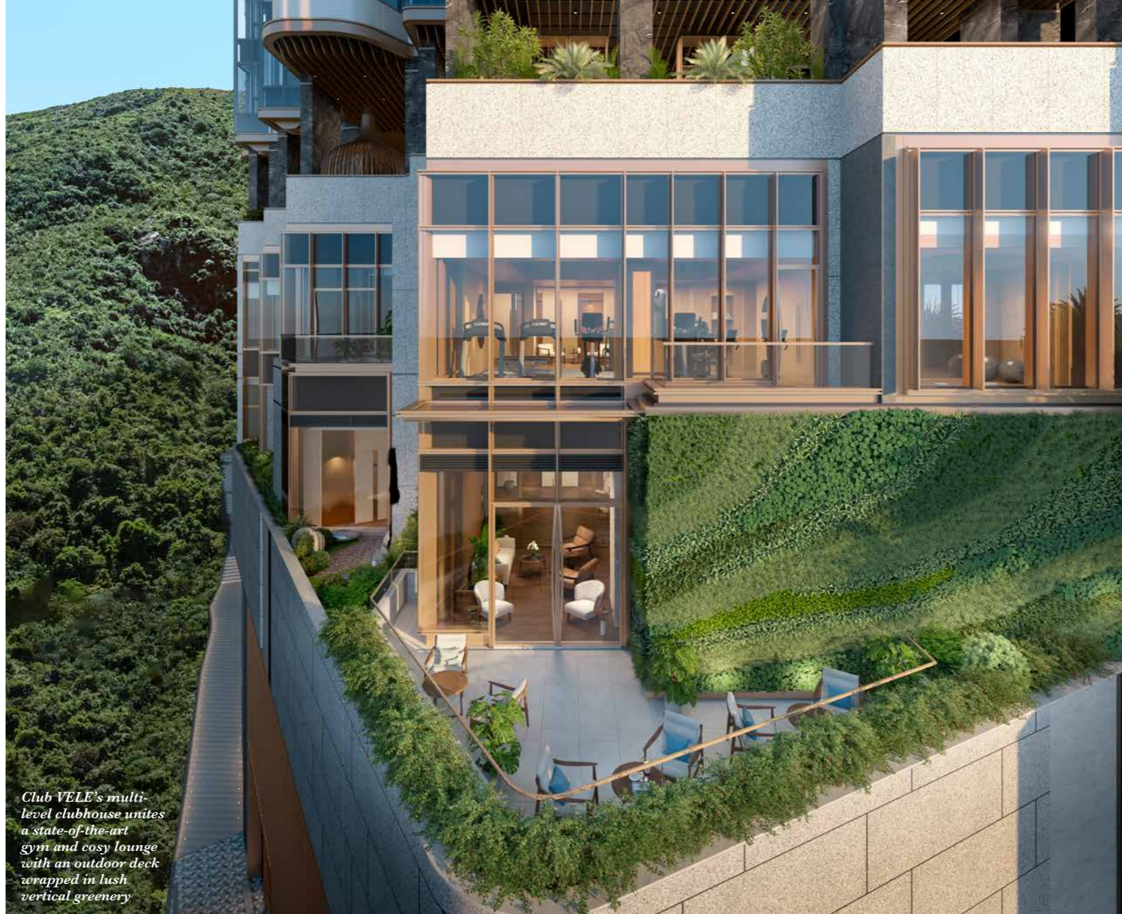
Club VELE's multi-level clubhouse unites a state-of-the-art gym and cosy lounge with an outdoor deck wrapped in lush vertical greenery

All bookings happen with a few taps on the “App VELE”, a digital concierge that brings every VELE amenity to your fingertips. Need to reserve the cinema room for a film premiere? Done. Want to book