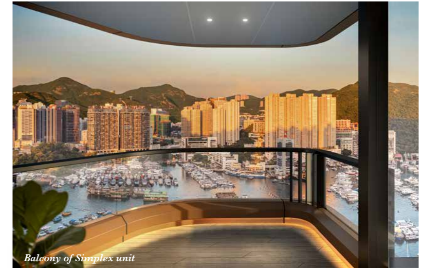
Balcony of Simplex unit