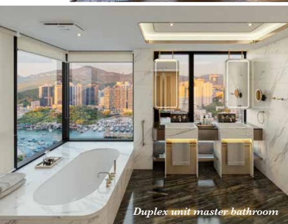
Duplex unit master bathroom

a private cooking demonstration in the chef's kitchen? Easy. Request your car to be brought to the lounge at 7.30pm or pre-authorise entry for friends arriving by ride-share? Every service is orchestrated through the app.