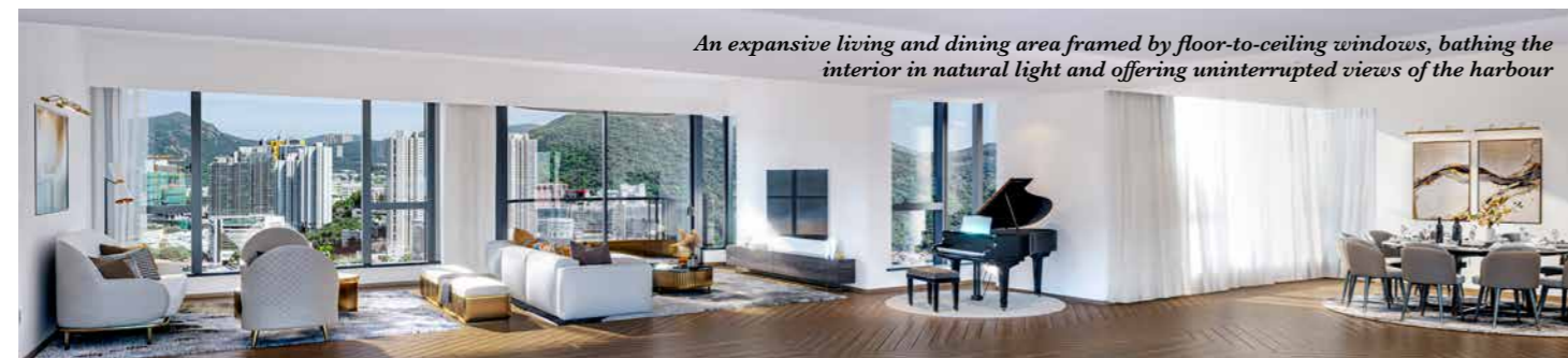
An expansive living and dining area framed by floor-to-ceiling windows, bathing the interior in natural light and offering uninterrupted views of the harbour