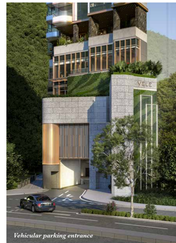
Vehicular parking entrance